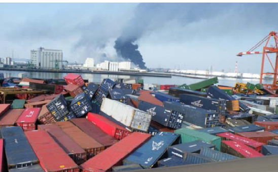
Image: Destruction at the Port of Sendai following the March disaster.