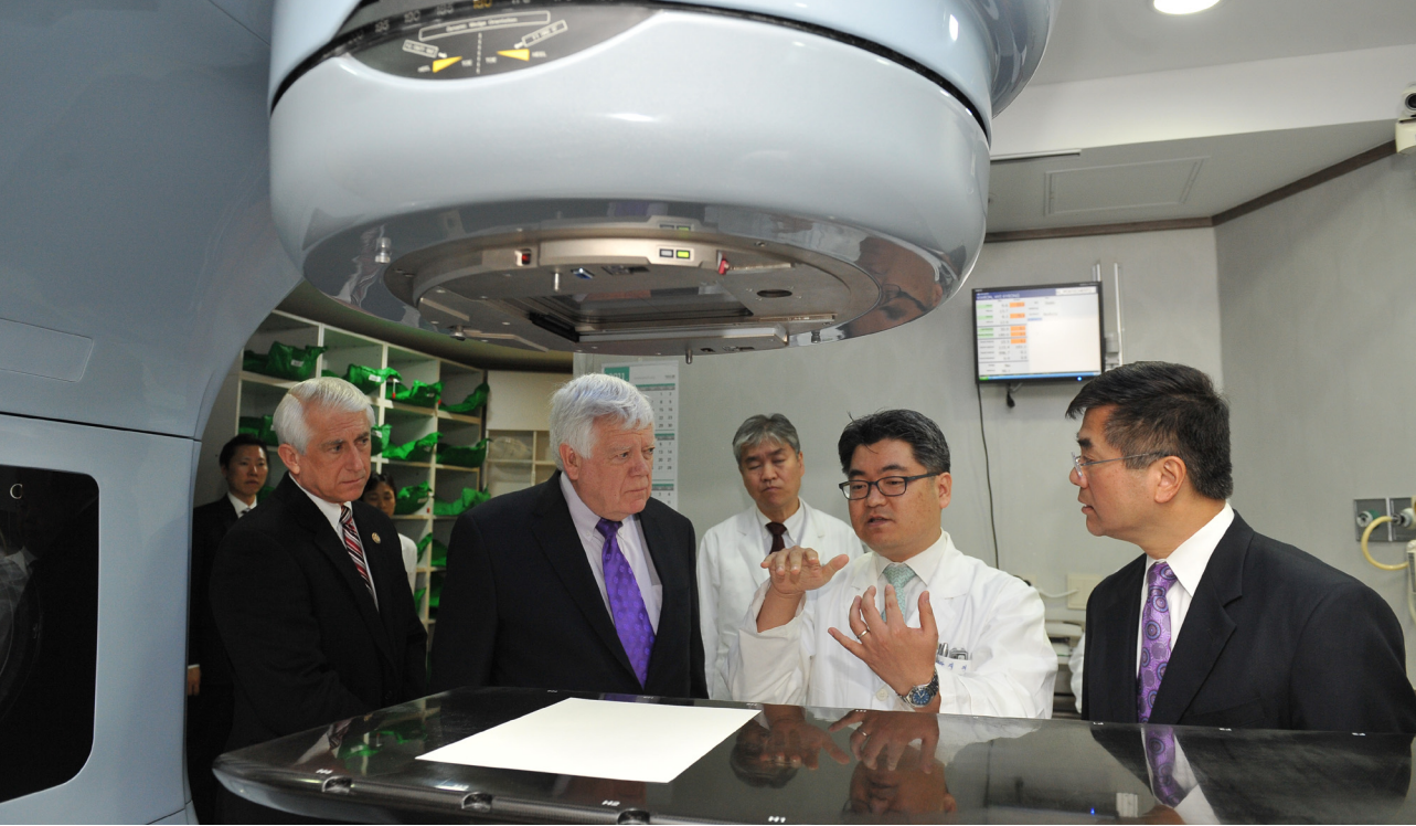
Image: Locke (right) views radiotherapy equipment at Pantech.

If you're interested in encouraging the ratification of the US-South Korean FTA, the members of the congressional delegation traveling with Locke might be a good place to start: Reps. Charles Rangel, D-NY; Jim McDermott, D-Wash.; Joseph Crowley, D-NY; and David Reichert, R-Wash.